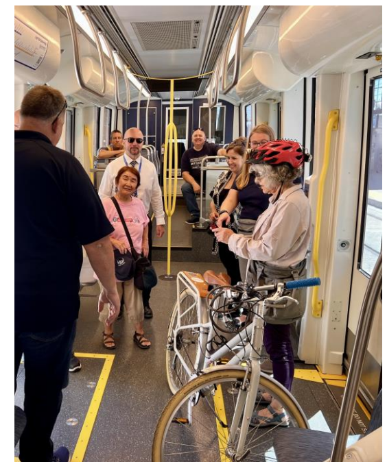
7 th & Richards/Township 9 Station