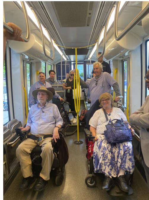
7 th & Richards/Township 9 Station