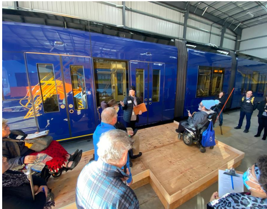
Siemens Manufacturing Facility