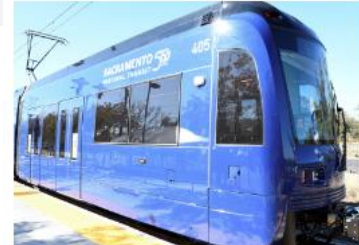
How to Ride New Low-Floor Light Rail Trains